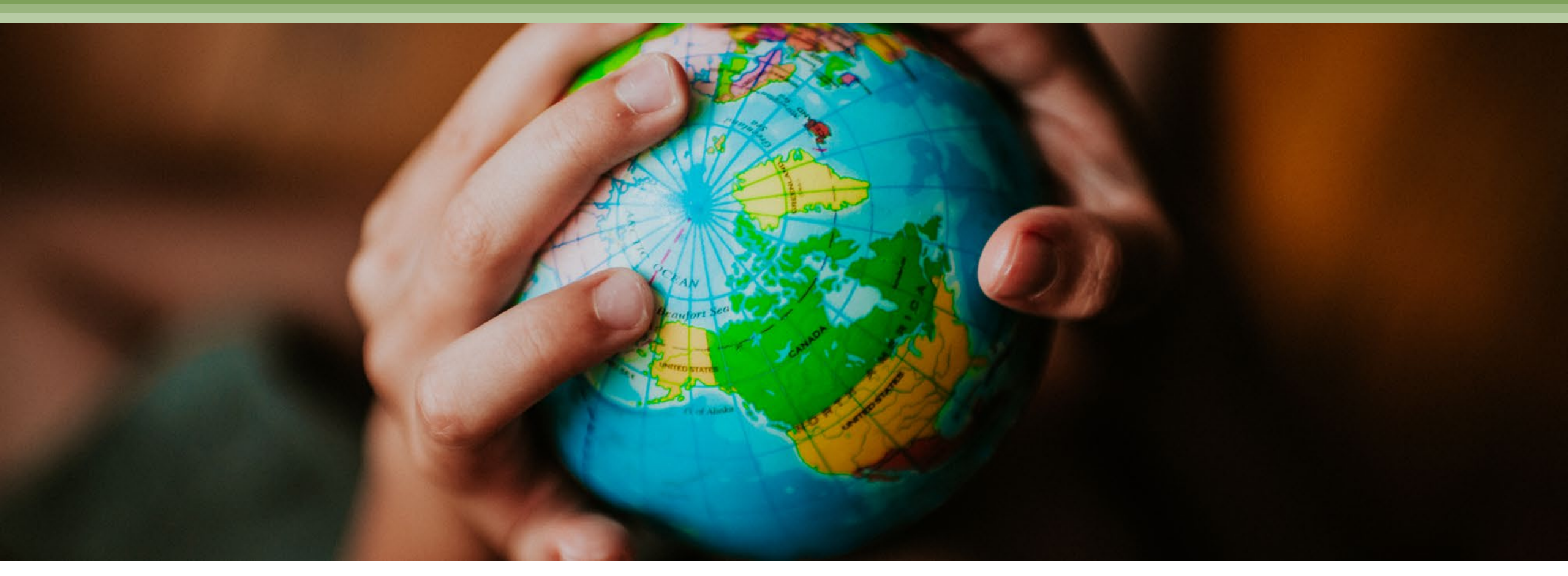
Foreign Direct Investment